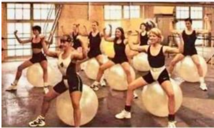
This picture was given to a grade 1 class and the children were asked to suggest a headline. The winning entry was: 'Never swallow your bubblegum.'

As you see, neither the ♦J nor the ♣J can ever be dummy entries. If you had carelessly taken the first trick with your ♠10, your contract would have surely gone down (unless your opponents made a stupid mistake).