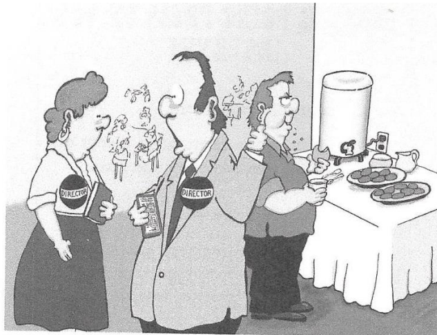
"Come to think of it, have you ever actually seen this guy at a bridge table?"