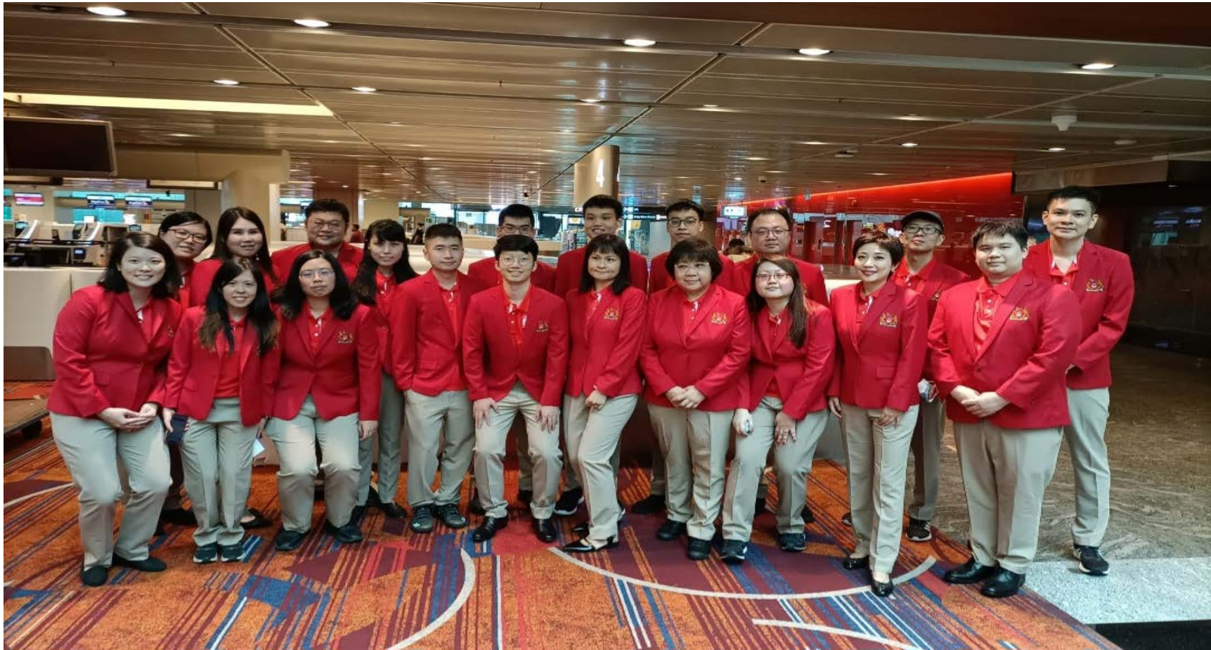
Singapore BRIDGE Elite Warriors