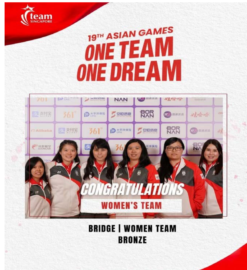
Singapore BRIDGE Elite Warriors