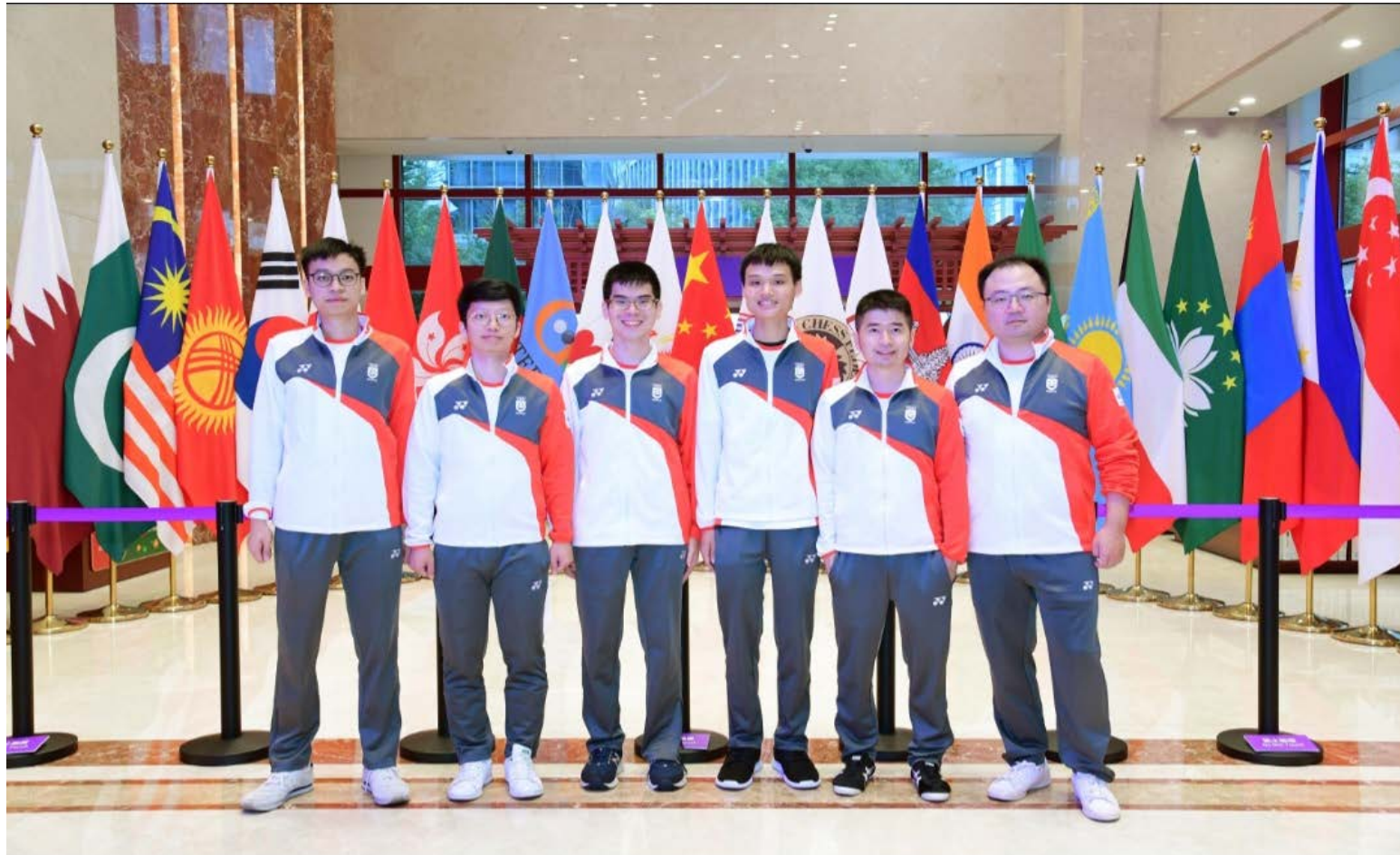
Singapore BRIDGE Elite Warriors