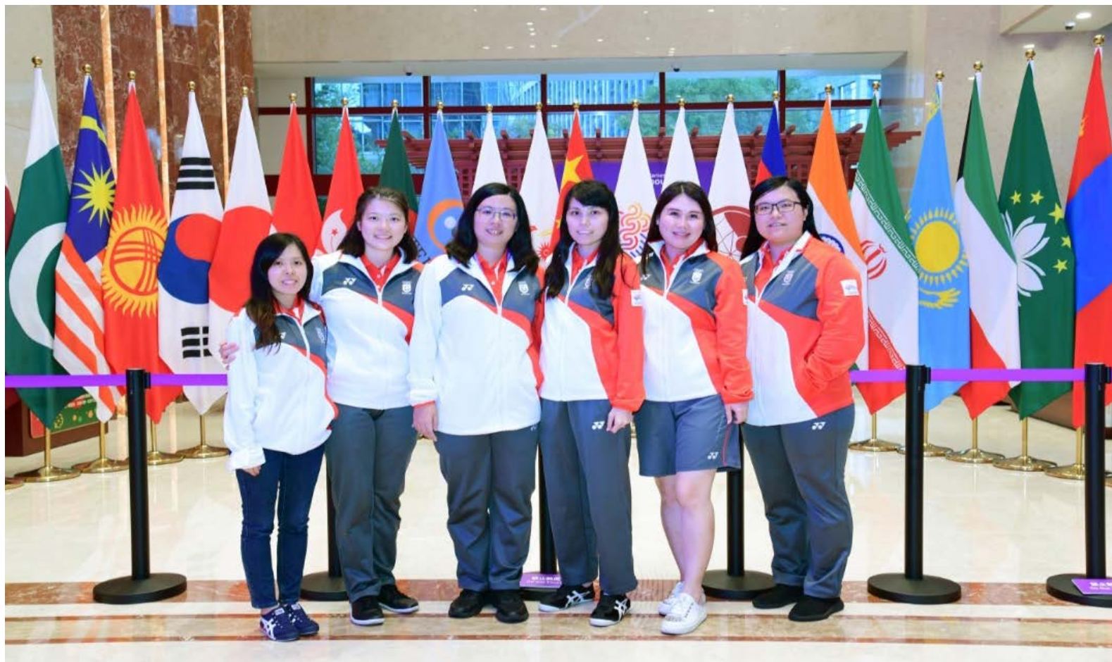
Singapore BRIDGE Elite Warriors