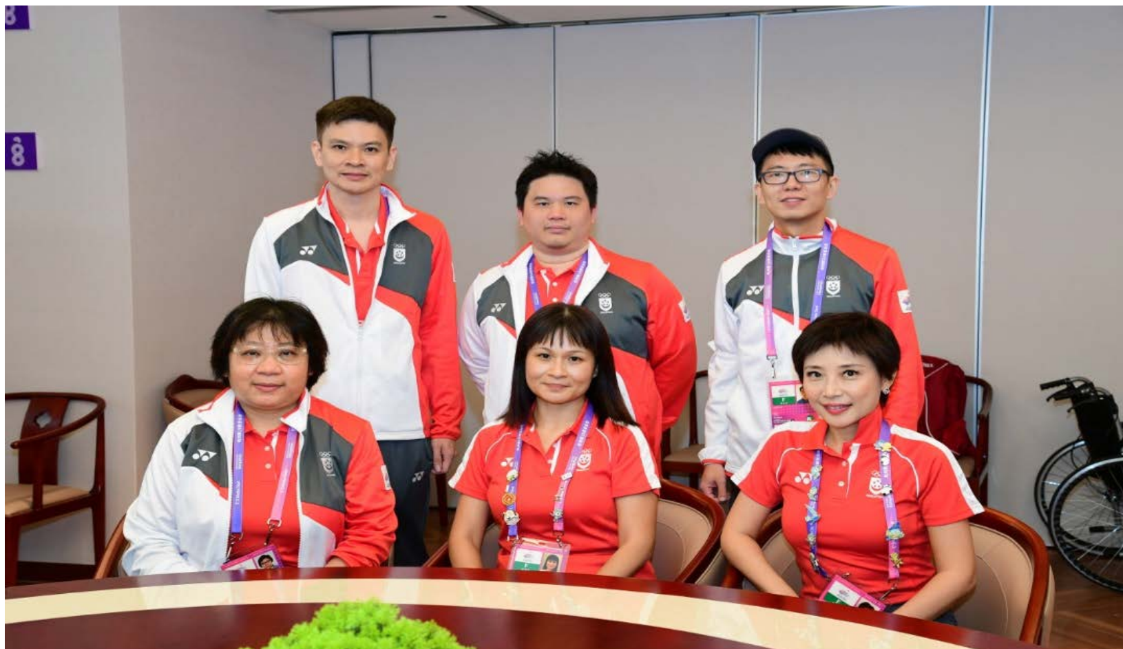
Singapore BRIDGE Elite Warriors