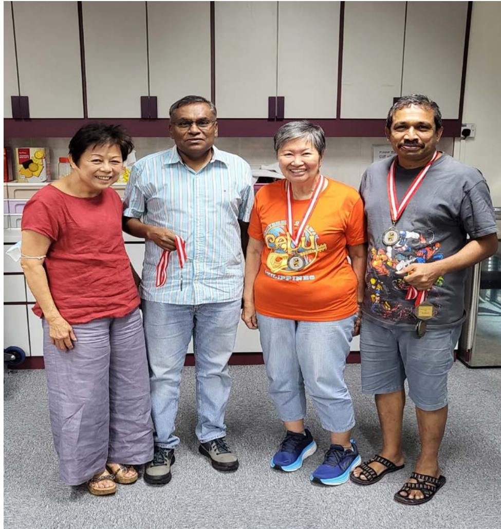
Champion Team : X-men