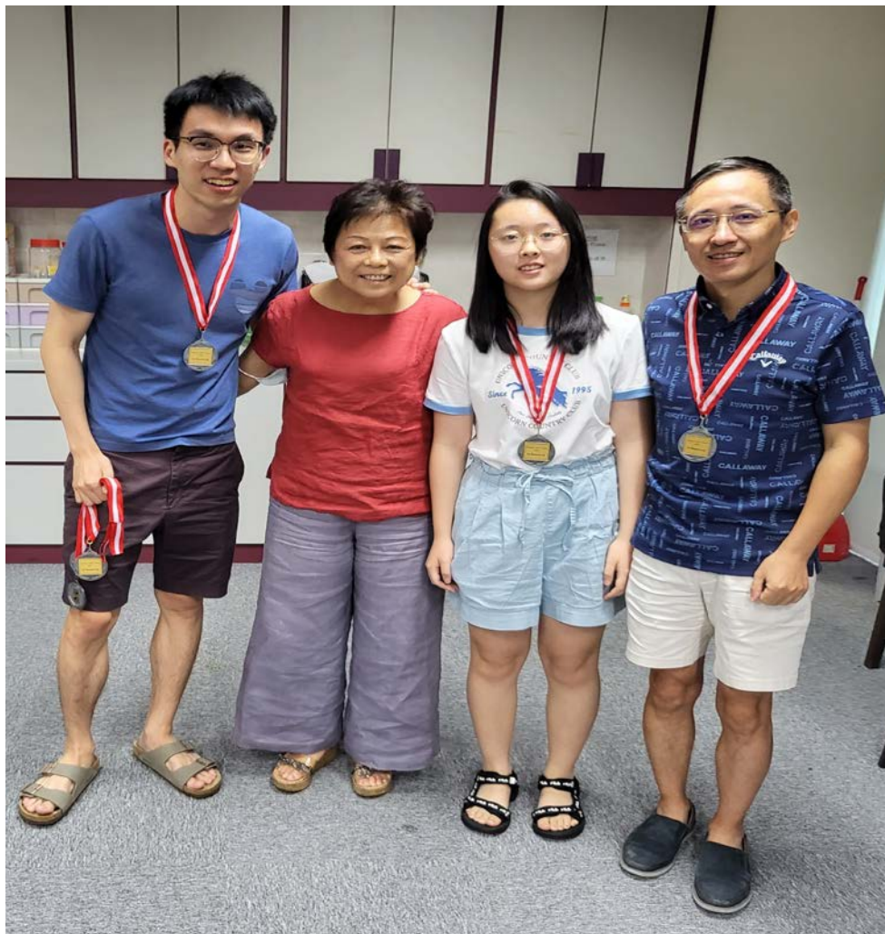
1 st Runners-up Team : Give Chance Please