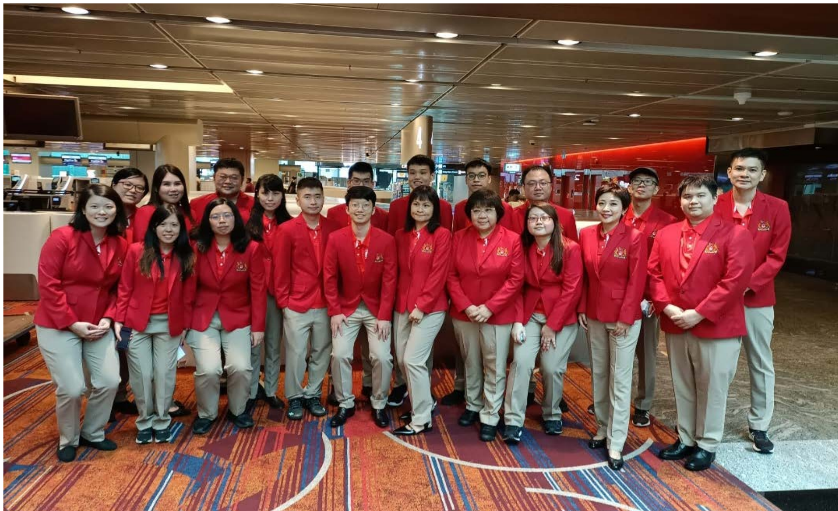
Singapore BRIDGE Elite Warriors