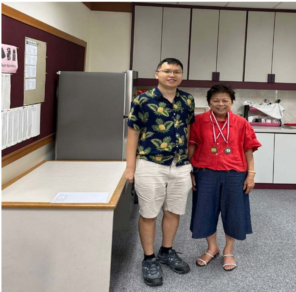
Champion Pair : Foo Yoke Lan & Alan Sia (Absent with apologies)