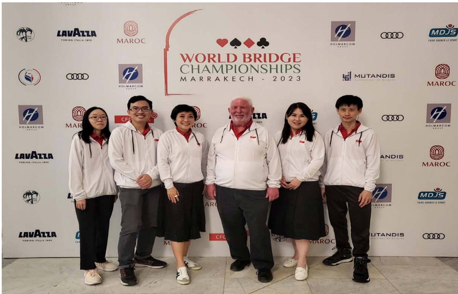
Held at Beautiful Marrakech, in Morocco. Team SINGAPORE in Action.