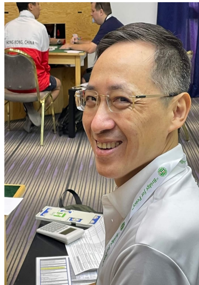
Held at Beautiful Marrakech, in Morocco. Team SINGAPORE in Action.