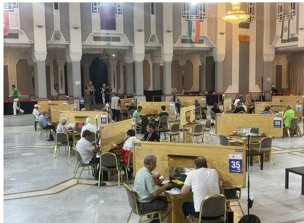
Held at Beautiful Marrakech, Morocco