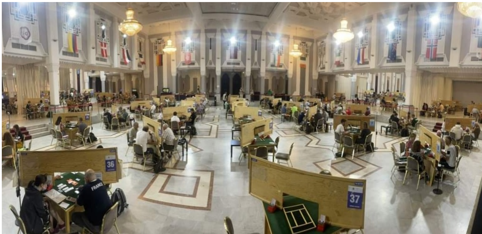
Held at Beautiful Marrakech, Morocco