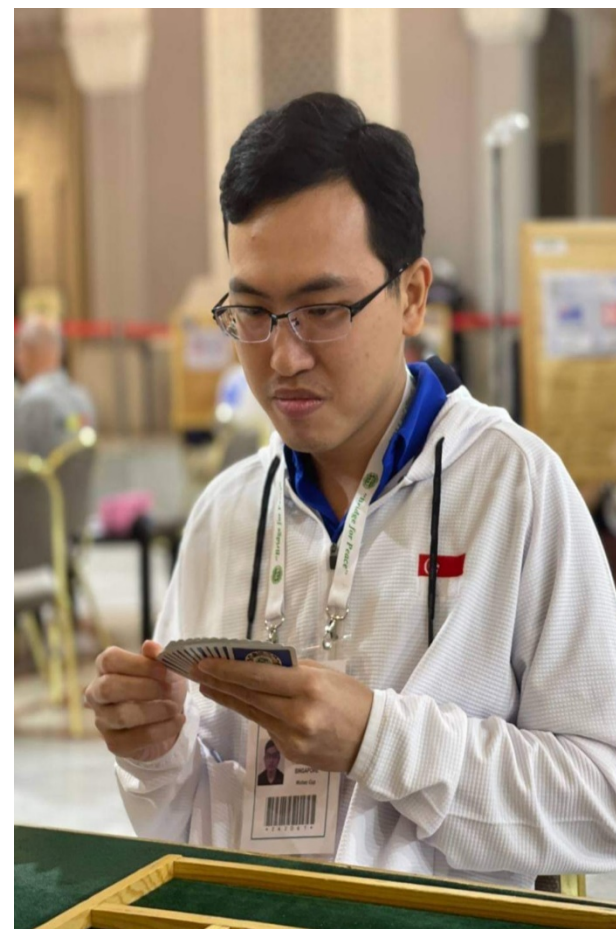
Held at Beautiful Marrakech, in Morocco. Team SINGAPORE in Action.