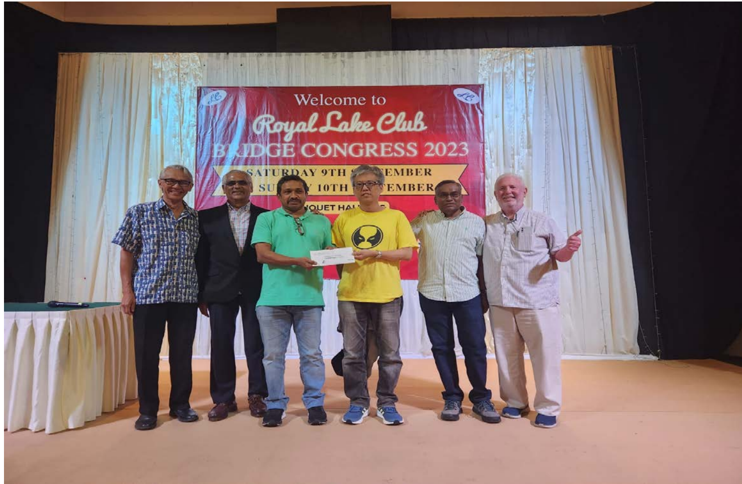
Held at Beautiful Royal Lake Club, Selangor, Malaysia. Team SINGAPORE – Open Teams Champion.