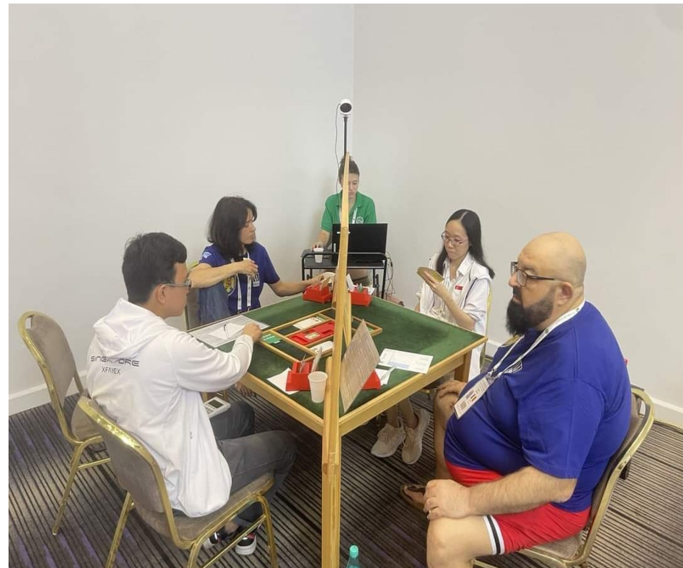
Held at Beautiful Marrakech, in Morocco. Team SINGAPORE in Action.