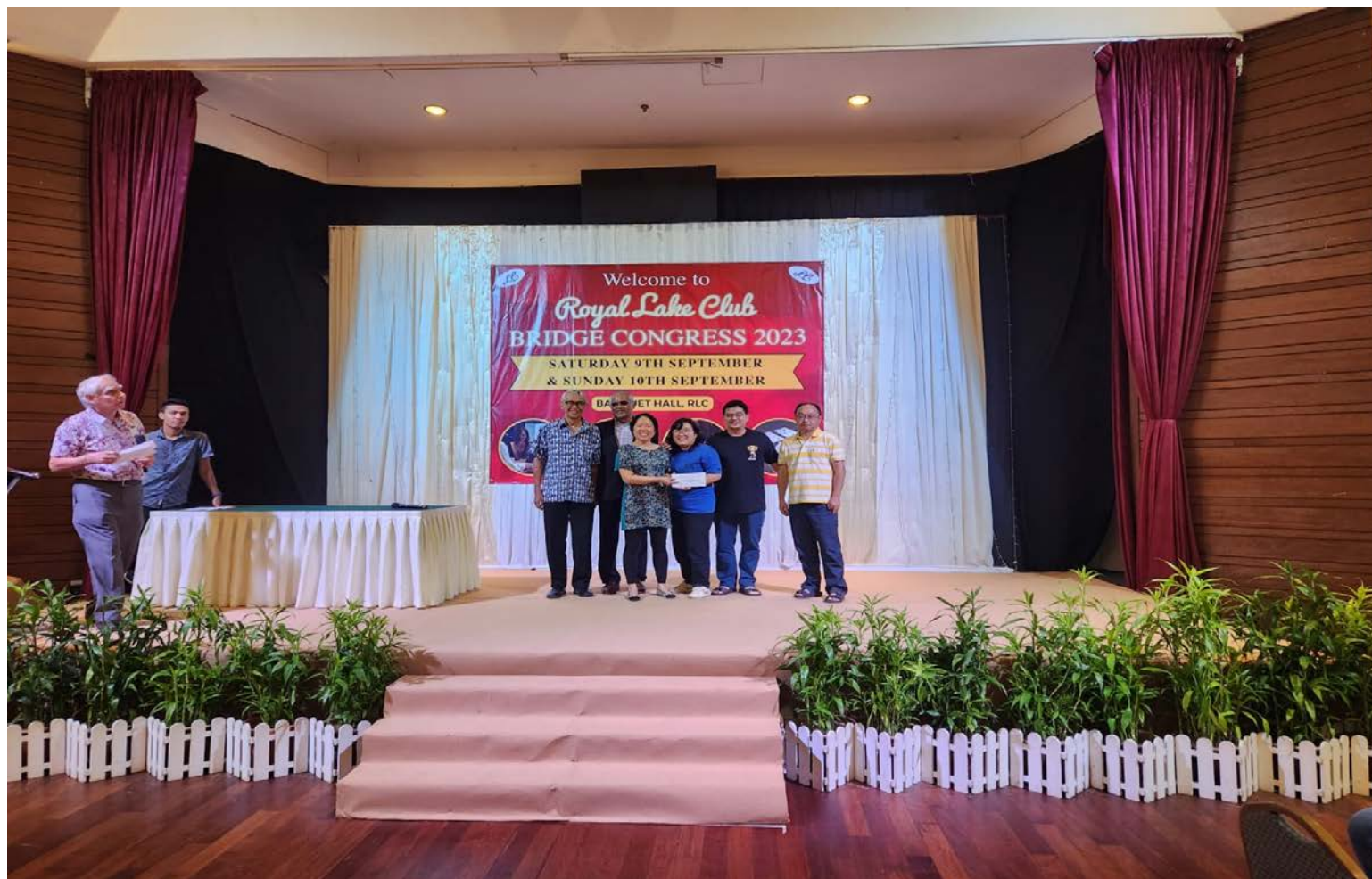
Held at Beautiful Royal Lake Club, Selangor, Malaysia. Team SINGAPORE – Open Teams 3 rd Placing.