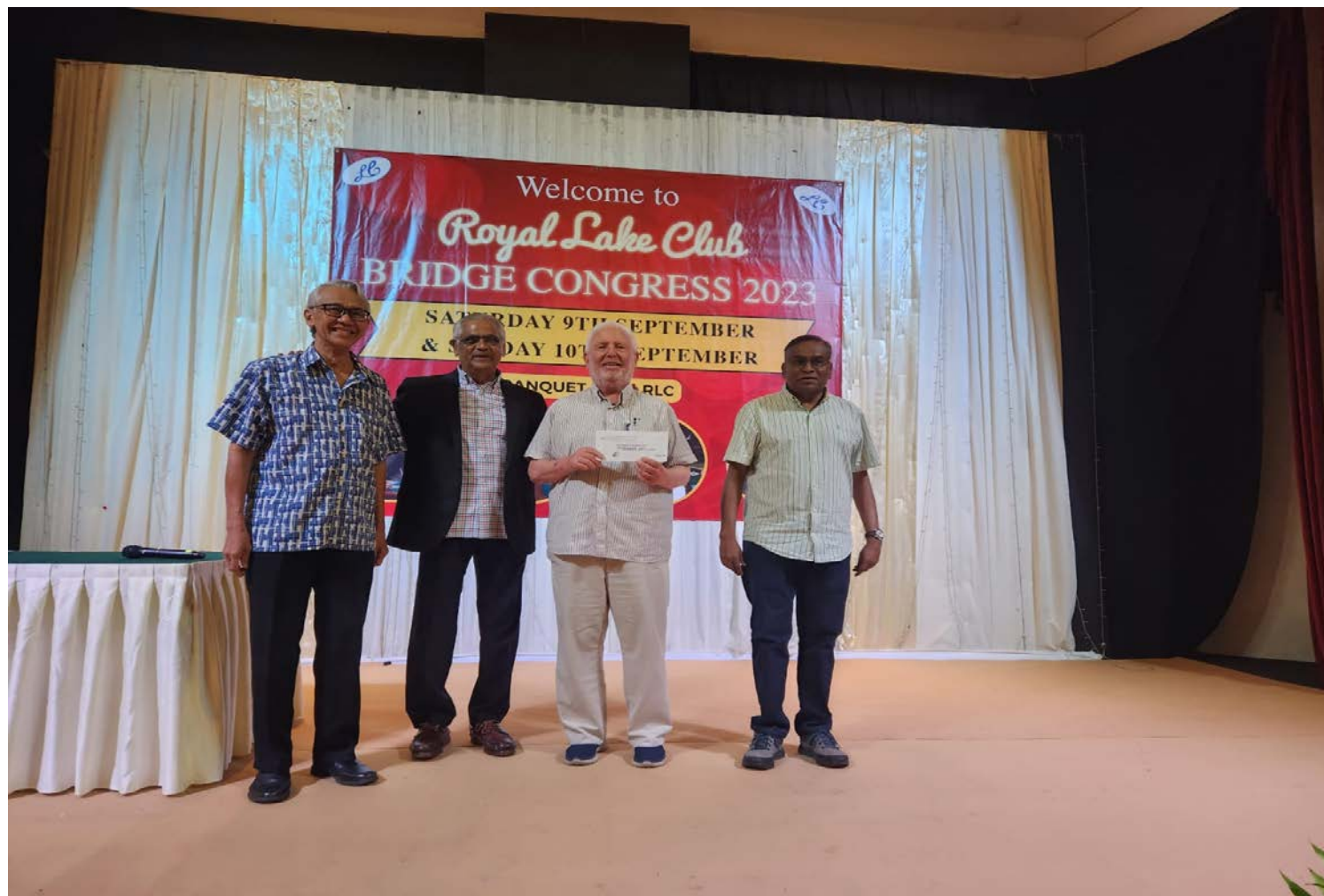
Held at Beautiful Royal Lake Club, Selangor, Malaysia. Team SINGAPORE – Open Pairs 2 nd Placing.