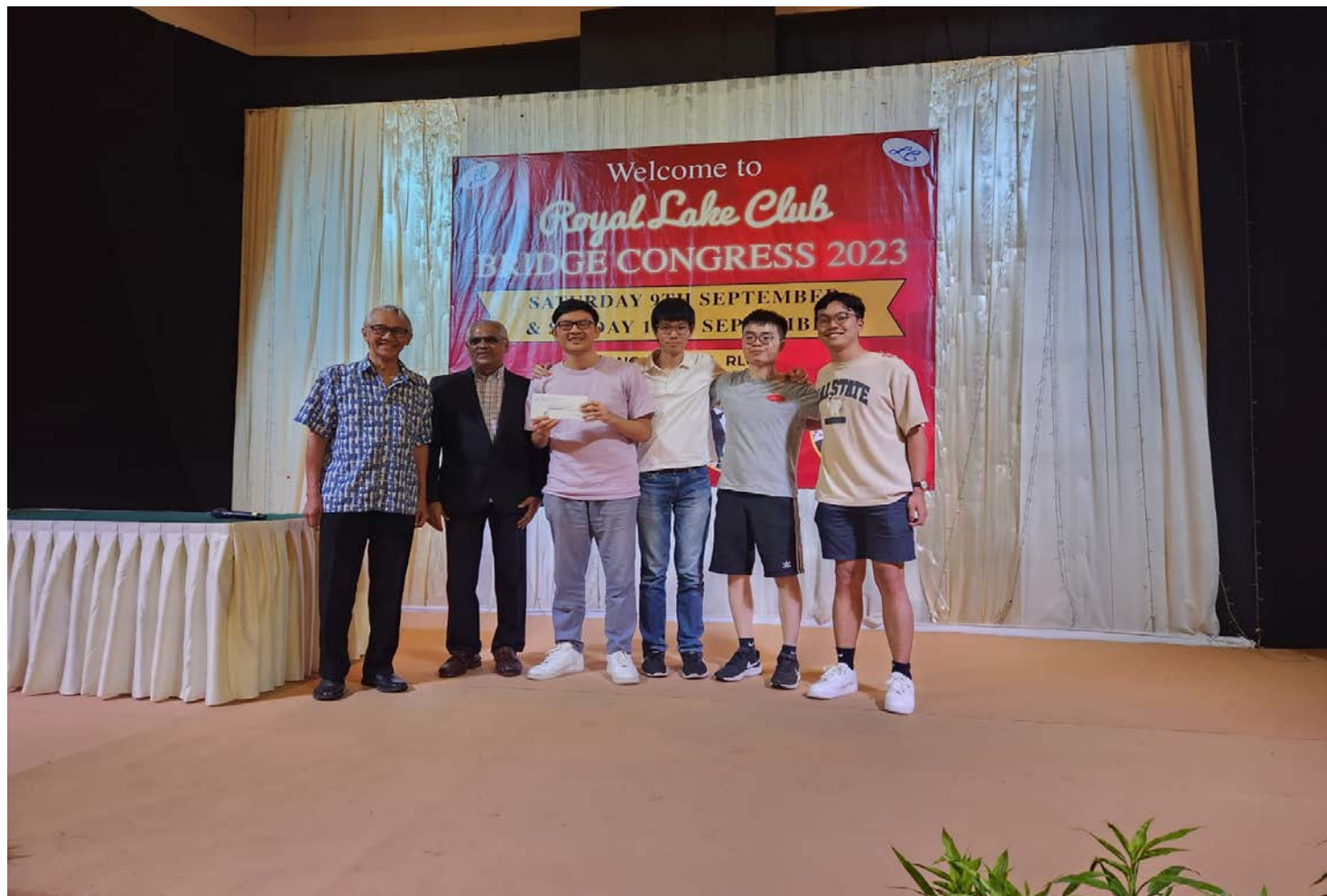
Held at Beautiful Royal Lake Club, Selangor, Malaysia. Team SINGAPORE – Open Teams Consolation Winner.