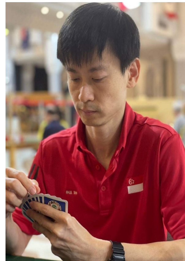
Held at Beautiful Marrakech, in Morocco. Team SINGAPORE in Action.