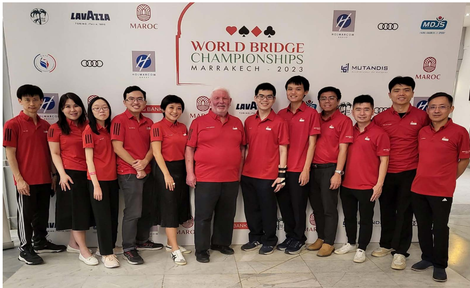
Held at Beautiful Marrakech, in Morocco. Team SINGAPORE in Action.