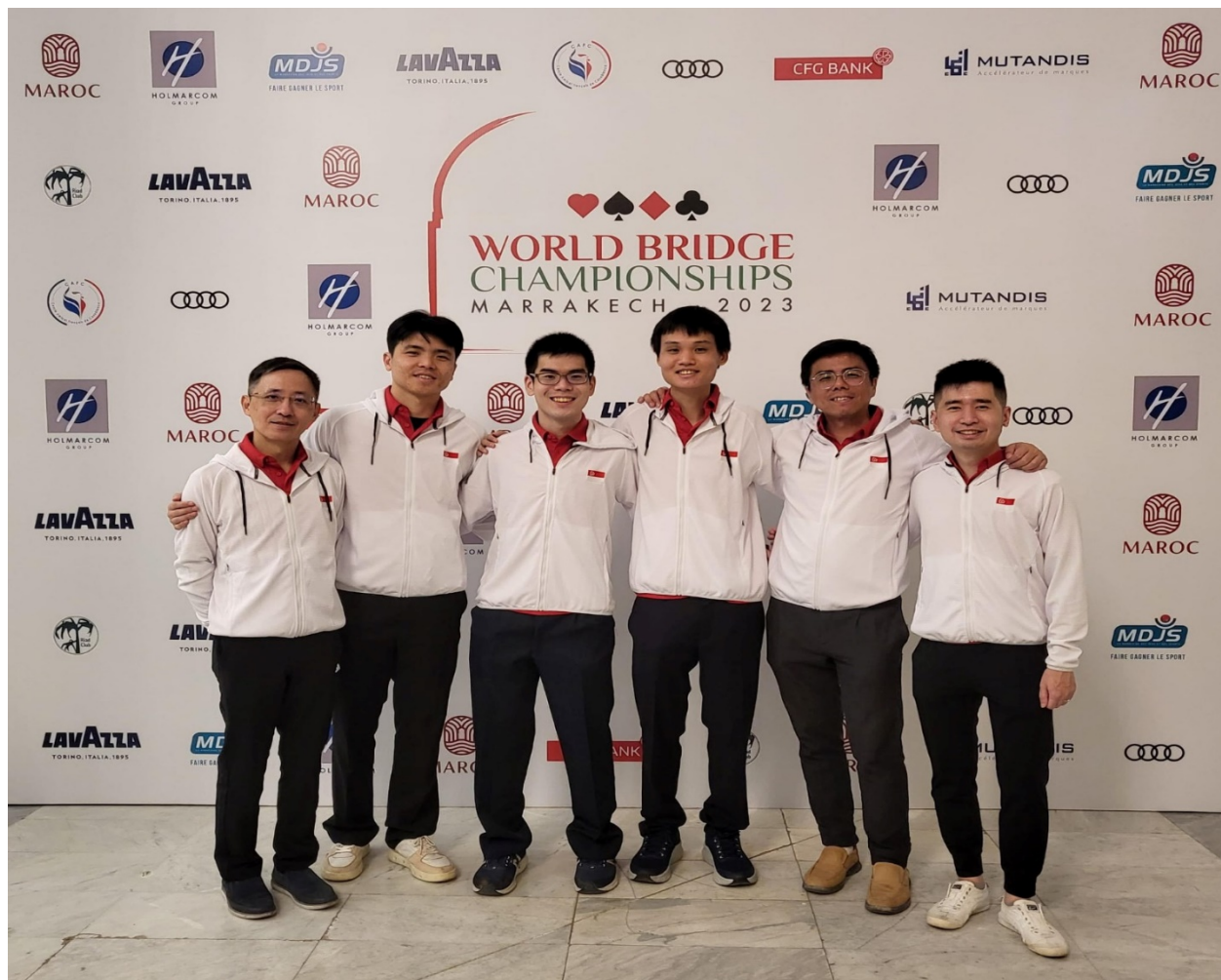
Held at Beautiful Marrakech, in Morocco. Team SINGAPORE in Action.